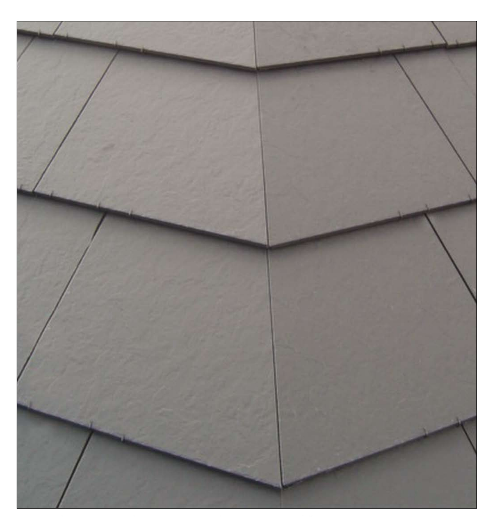
Nu-Lok™ provides a neat, sharp mitred hip line

Sheraz explains: "As soon as I read an article on the Nu-Lok™ Roofing System with its unique installation system and 50 year guarantee, I knew I had found what I was looking for."